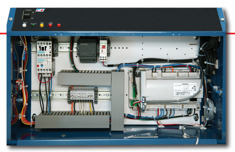
Nova Plus 2 is furnished with the exclusive Alpha System LED display. Modulating control is achieved through the use of linkageless controls mounted in the control panel.