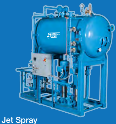
.005 cc/Liter Spray Type Pressurized Deaerators