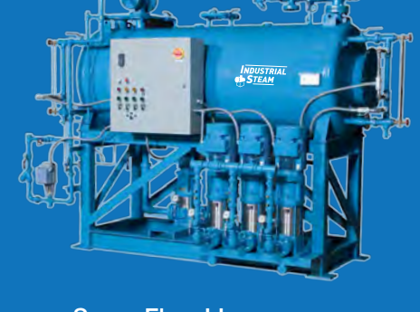
Spray Flow I I .005 cc/Liter Atmospheric Recycling Deaerators