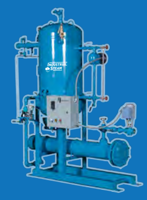
Blowdown Heat Recovery Systems, Blowdown Separators

Have questions or need help specifying this equipment? Email: engineering@industrialsteam.com Need help with an existing system or parts? Email: techsupport@industrialsteam.com Looking for a local representative? Email: sales@industrialsteam.com Literature available for download at industrialsteam.com