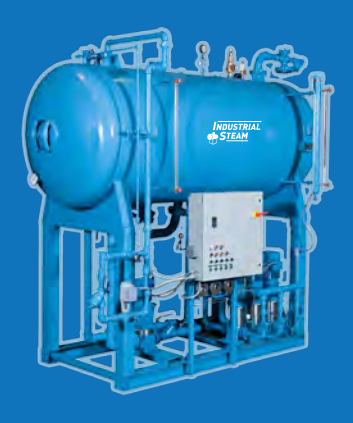
Steam Flow .005 cc/Liter Pressurized Recycling Deaerators