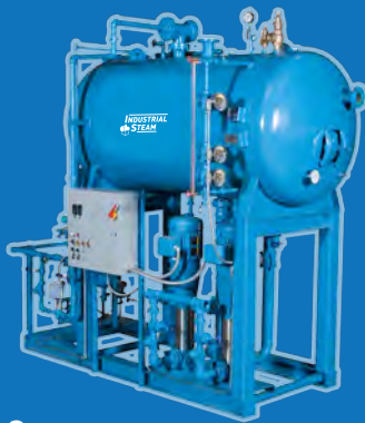
Jet Spray .005 cc/Liter Spray Type Pressurized Deaerators