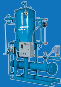
Blowdown Heat Recovery Systems, Blowdown Separators

Have questions or need help specifying this equipment? Email: engineering@industrialsteam.com