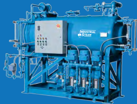
Spray Flow II .005 cc/Liter Atmospheric Recycling Deaerators