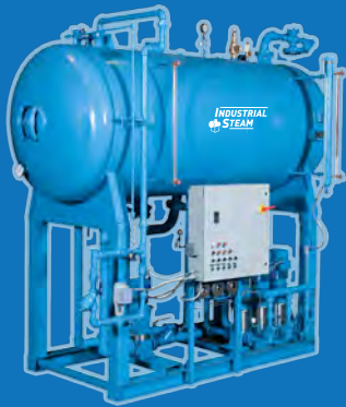
Steam Flow .005 cc/Liter Pressurized Recycling Deaerators